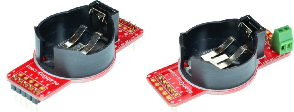
Figure 3: CR2477-BO-V1A Various connections