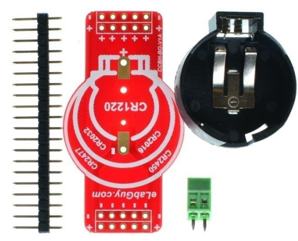
Figure 1: Parts inside the kit (Note: the module is not assembled, user can decide which connector to use on the module.)